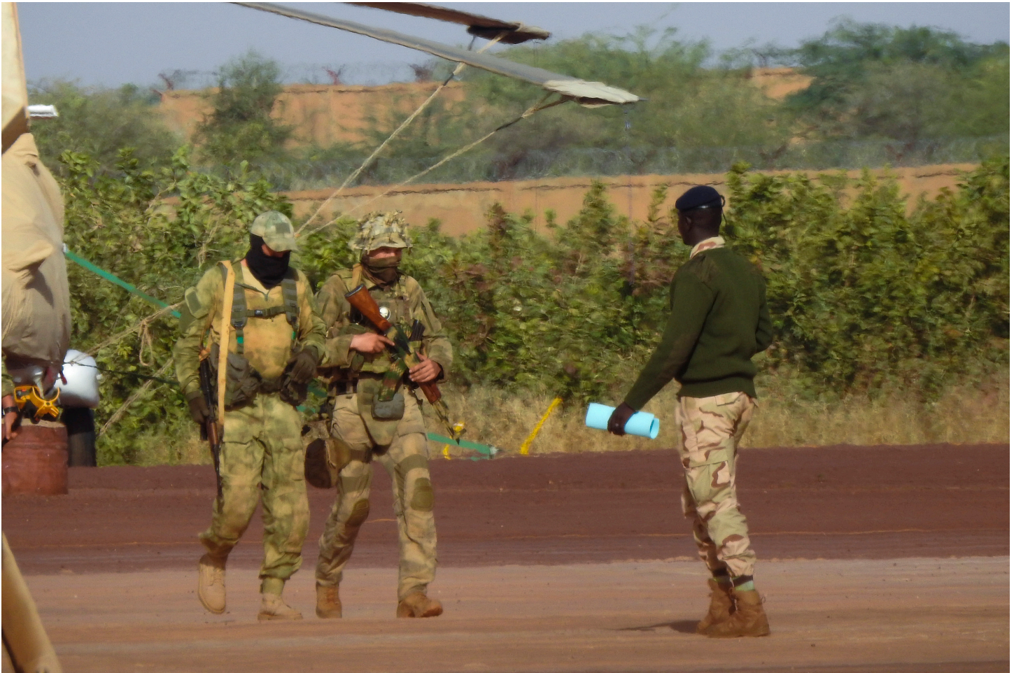
This photograph handed out by French military shows Russian mercenaries in Sévaré in central Mali in February 2022. A white skull, a feature of the Wagner Group's insignia, appears to be visible on a vest.