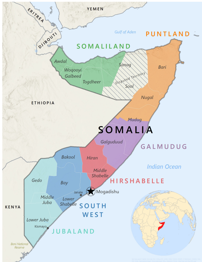
Somalia

operations led by the Somali National Army (SNA) in Hiran, Bay, Bakool, Galgaduud, and Middle Shabelle regions. 16 By late September, the Somali government stated that government forces and local clan militias (which are called Community Defense Forces by the government) had liberated much of the Hiran and Galgaduud regions in central Somalia. Somali-led offensives in early December recovered Adan Yabaal town, one of the two major towns held by al-Shabaab in Middle Shabelle that was a key prior stronghold for al-Shabaab. 17 Adan Yabaal had been under the control of al-Shabaab over the past 15 years, though it was briefly taken by AMISOM and government forces in 2016 before reverting back to al-Shabaab. The group has reverted to its previous tactic of withdrawal without confrontation, a tactic they had previously only displayed when confronted by A.U. forces. 18