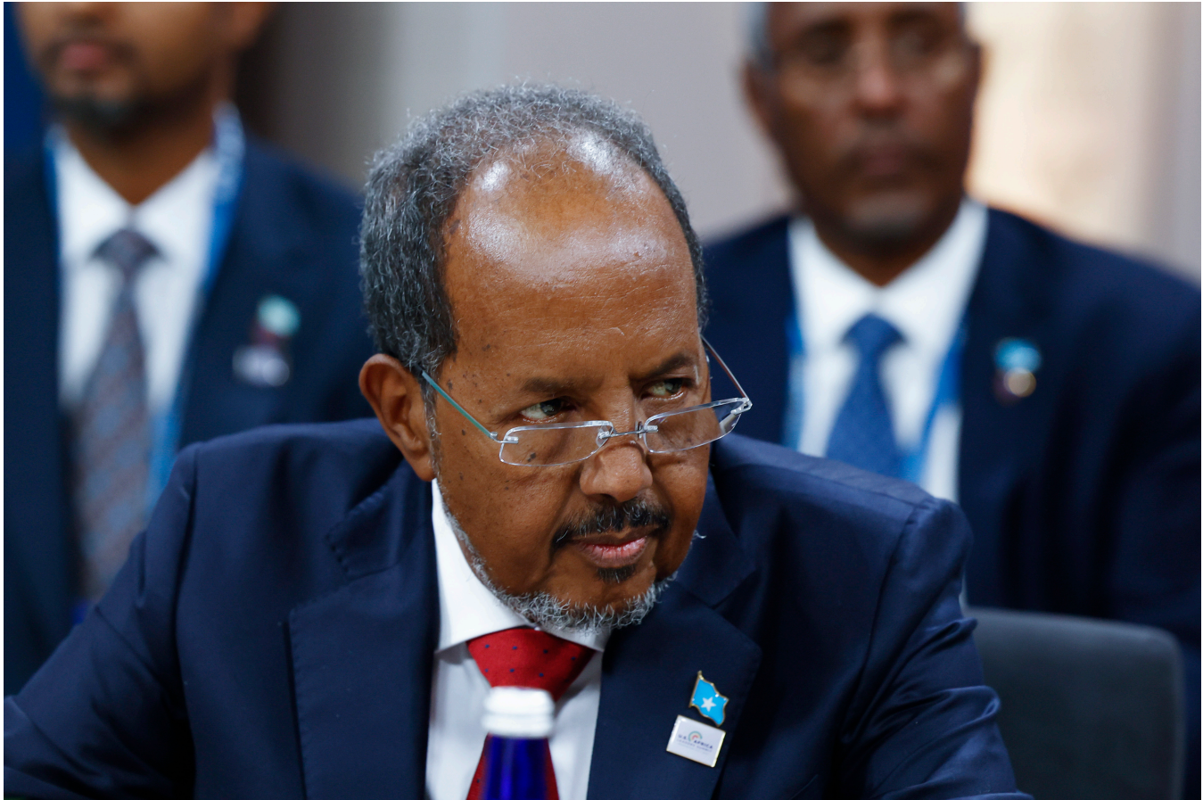
Somalia's President Hassan Sheikh Mohamud looks on during a meeting with U.S. Secretary of State Antony Blinken, U.S. Defense Secretary Lloyd Austin, Djibouti's President Ismail Omar Guelleh, and Niger's President Mohamed Bazoum during the U.S.-Africa Leaders Summit 2022 on December 13, 2022, in Washington, D.C.

the resourcing and coordination challenges faced by AMISOM, the counterinsurgency efforts in Somalia lost valuable psychological ground by emphasizing the use of force at the start but neglecting the follow-along stabilization and rehabilitation aspects. The operations were also perceived to be externally led, denying the Somali authorities the local legitimacy needed to augment the military operations. The kinetic operations also merely displaced al-Shabaab, as the group, rather than confront the joint SNA and AMISOM forces, withdrew. 36