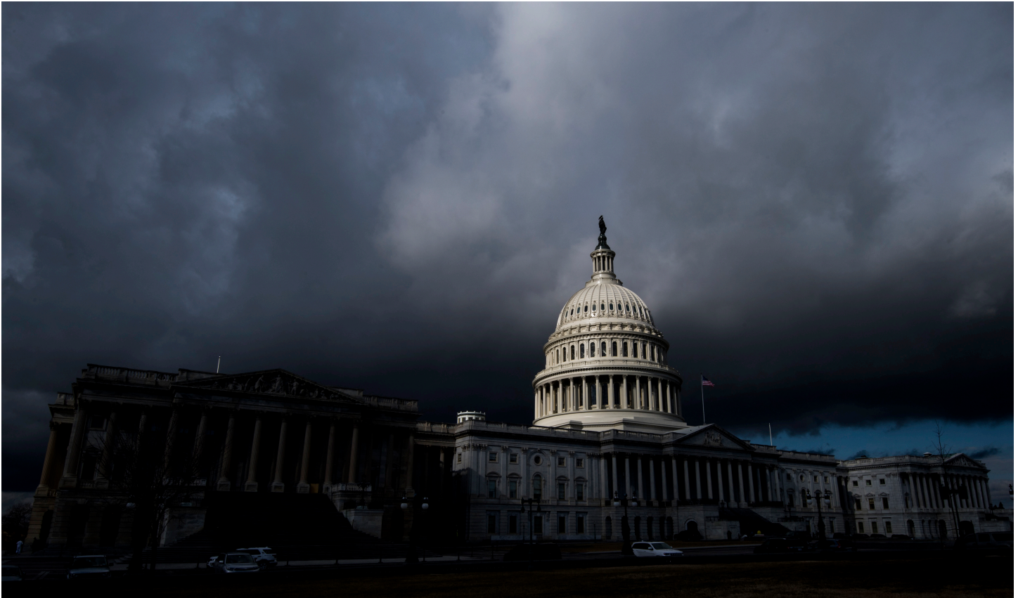
Storm clouds pass over the dome of the U.S. Capitol building on January 23, 2018.

regional affiliate are plotting to attack the Homeland, and we have no indications that these individuals are involved in external attack plotting.” 25