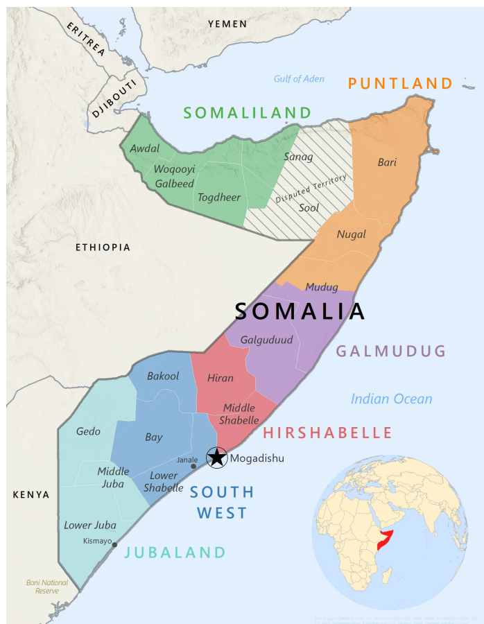
Somalia

political atmosphere really goes from bad to worse, and Somalis take their eyes off stabilizing the country, they take their eye off the main prize, which is to stabilize and deliver services to the population. At that moment, al-Shabaab portrayed itself as a viable alternative group. Whenever these political developments happen and it becomes very volatile and poisonous, al-Shabaab creates doubts in state issues in the eyes of the public, so this also contributes to their resilience and presence in the country.