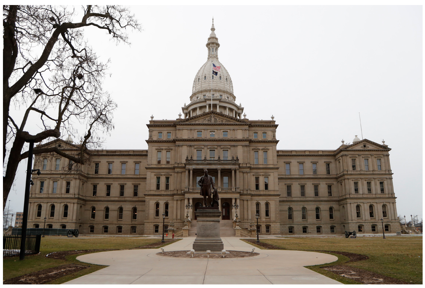
The State Capitol building in Lansing, Michigan, on January 17, 2020