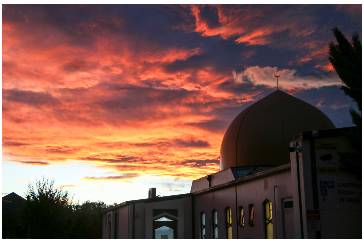
The Al Noor Mosque in Christchurch, New Zealand, is pictured on March 15, 2021, two years after the deadly attack there.

"metapolitics." By attempting to extend the Overton window (the range of ideas considered acceptable in mainstream political discourse) toward the extreme far-right, they hope to lay the cultural and intellectual groundwork for an eventual authoritarian transformation of liberal democracies.15