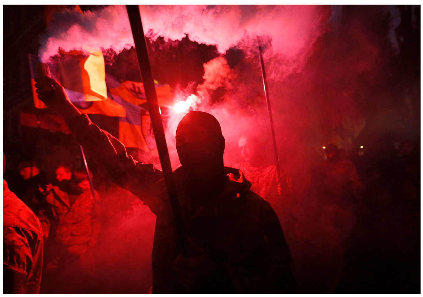
Fighters from the Azov volunteer battalion ignite flares during a march marking the 72nd anniversary of the Ukrainian Insurgent Army in Kiev, Ukraine, on October 14, 2014.

CTC SENTINEL | JULY/AUGUST 2021 MUSHARBASH